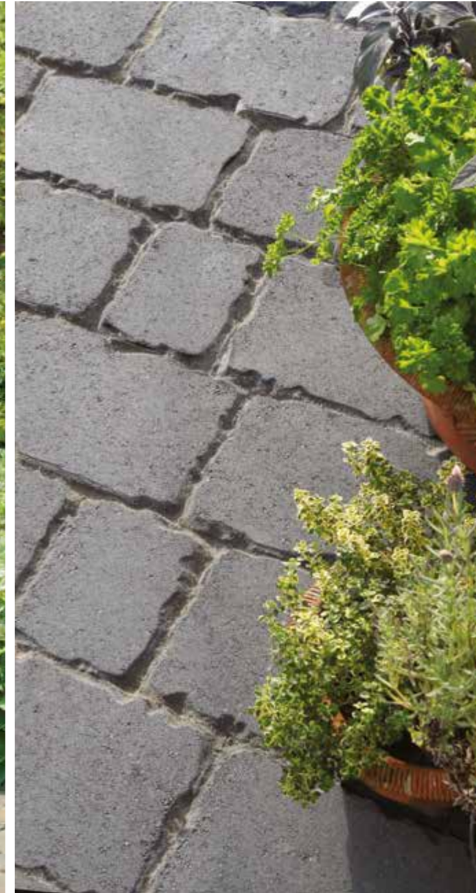
Applesby Antique Paviors, Charcoal