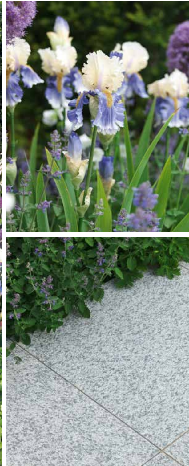
Arctic Granite, Glacier