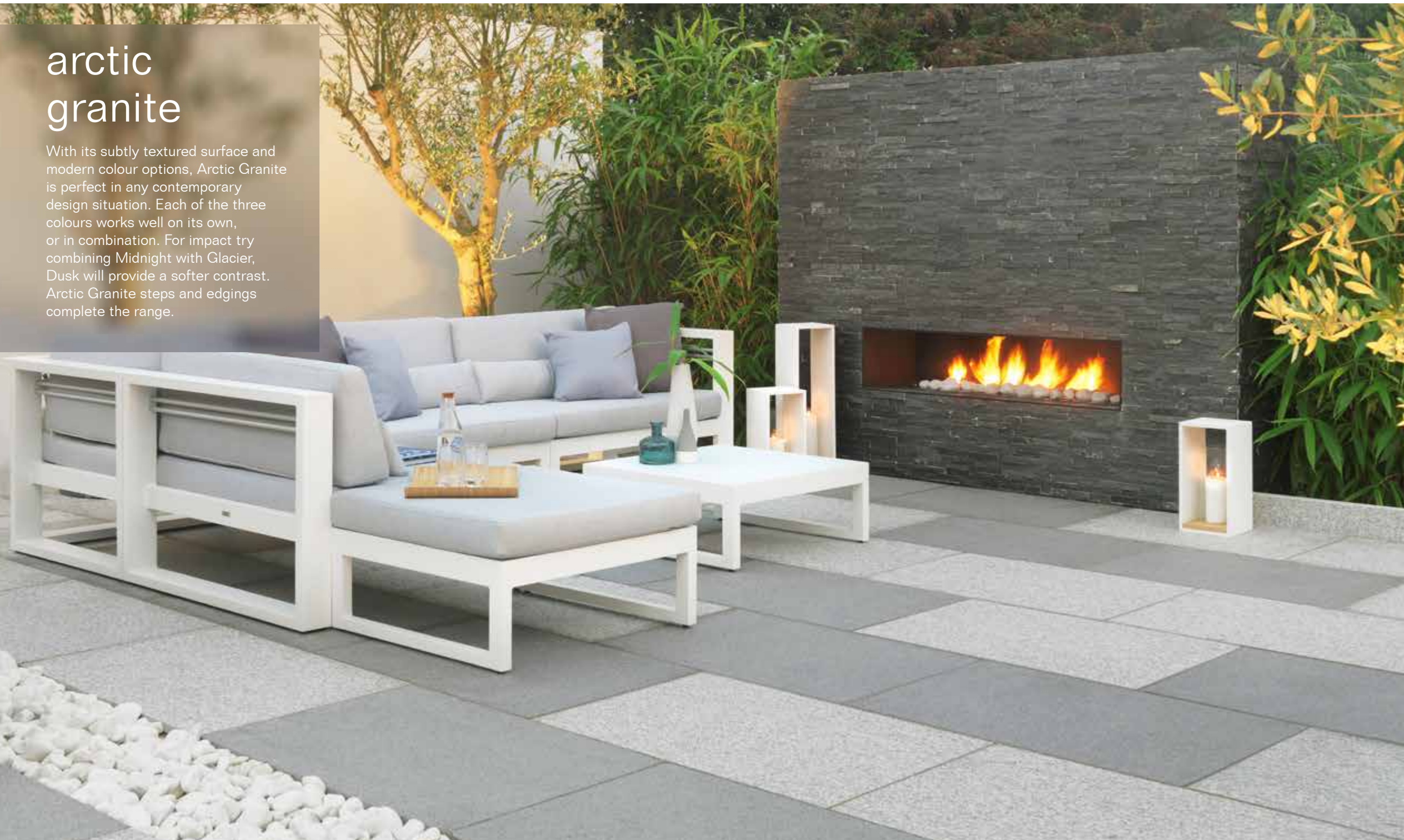
Arctic Granite Step, Dusk

With its subtly textured surface and modern colour options, Arctic Granite is perfect in any contemporary design situation. Each of the three colours works well on its own, or in combination. For impact try combining Midnight with Glacier, Dusk will provide a softer contrast. Arctic Granite steps and edgings complete the range.