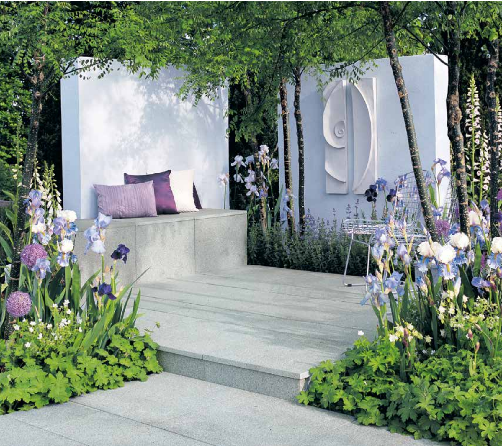
Arctic Granite, Glacier