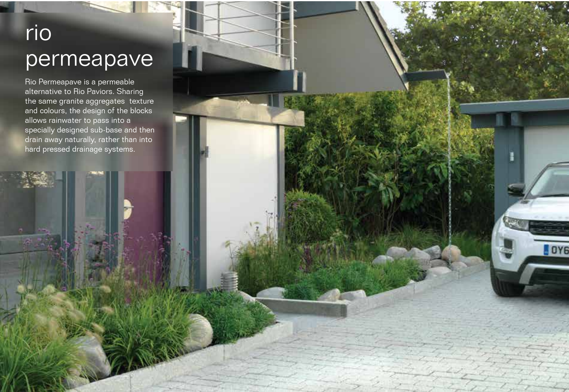
Rio Permeapave, Carbon with Rio Driveway Edging, Silver and Rio Walling, Silver

Rio Permeapave is a permeable alternative to Rio Paviers. Sharing the same granite aggregates texture and colours, the design of the blocks allows rainwater to pass into a specially designed sub-base and then drain away naturally, rather than into hard pressed drainage systems.