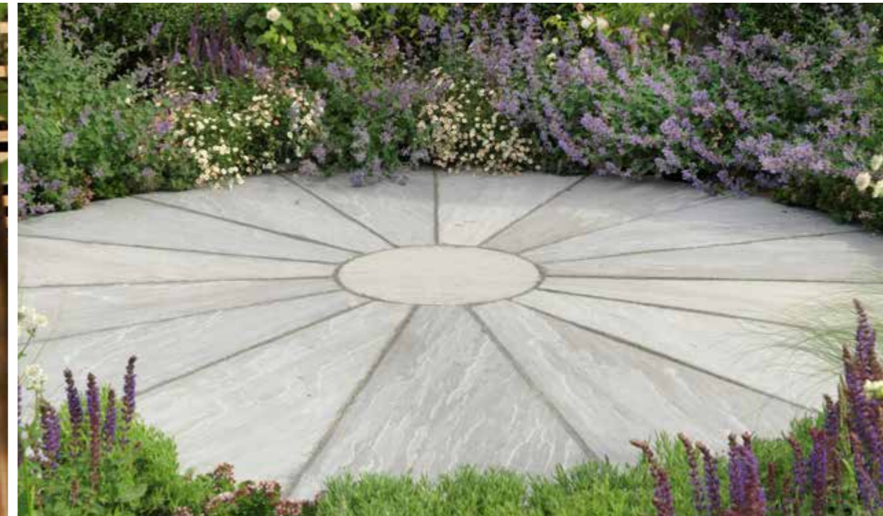
Trustone Circle, Fellstyle