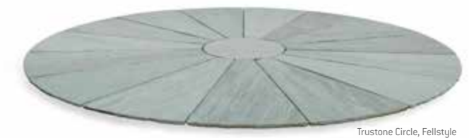
Trustone Circle, Fellstyle

Thickness calibrated to 22mm. For dimensions see page 142