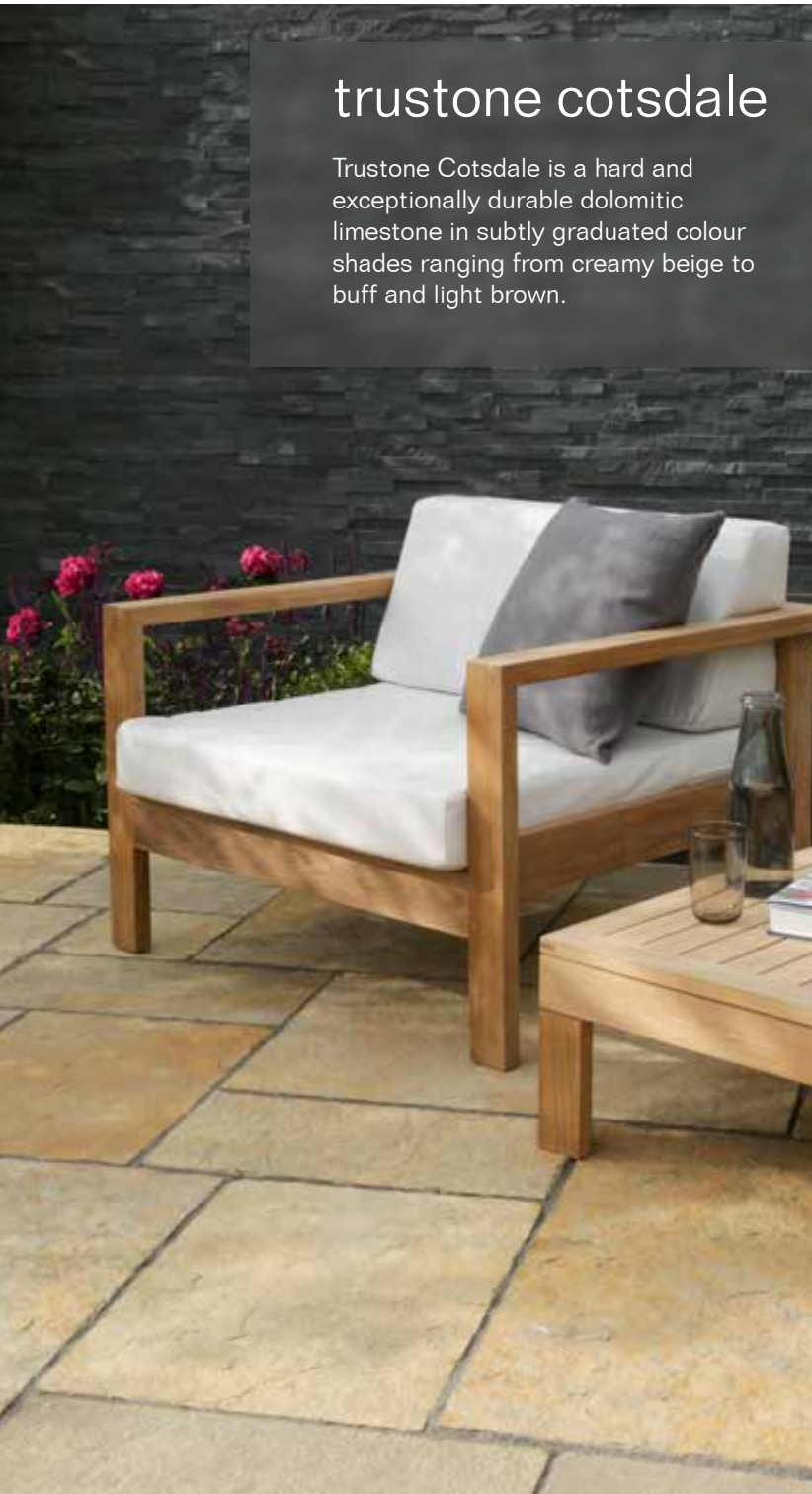
Trustone, Cotsdale and Exilis Walling, Slate Dusk

Trustone Cotsdale is a hard and exceptionally durable dolomitic limestone in subtly graduated colour shades ranging from creamy beige to buff and light brown.