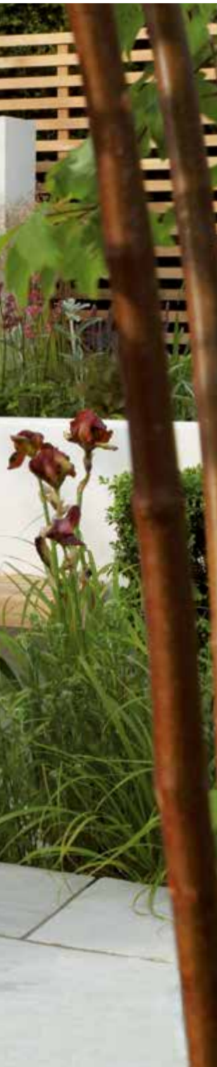
Trustone Circle, Fellstyle new