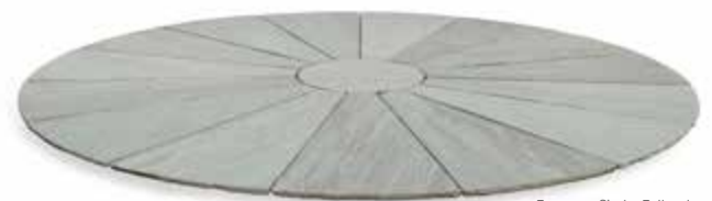
Trustone Circle, Fellstyle

Thickness calibrated to 22mm. For dimensions see page 147